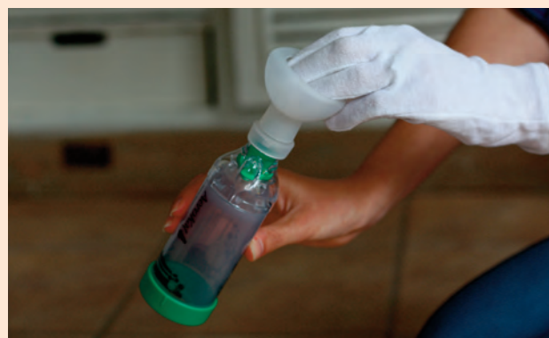
Figure 3: Transferring the cat's scent on to the inhaler using a glove

A cat should not be held against its will while an inhaler is being administered but gentle restraint holding the cat may help keep the cat