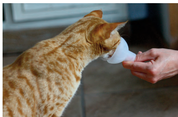
Figure 2: Introducing the cat to the face mask. Note the cat pushes its face into the mask rather than the mask being pushed towards its face

A training plan should also identify which order things should be trained in for a particular cat. While some things need to be trained sequentially (ie, voluntarily placing of the muzzle into the mask should be fully established before moving on to building duration of this behaviour), other behaviours could be trained simultaneously, although within different training sessions, for example, being calm around the sight and sound of the inhaler.