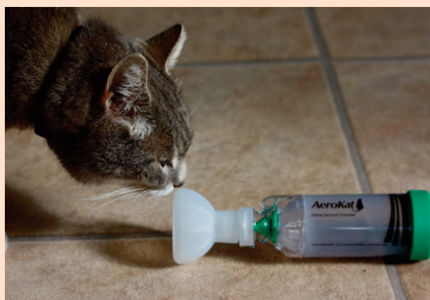
Figure 1: Give the cat a positive consequence at the point of the desired behaviour, such as approaching the inhaler

In training, it is also very useful to associate the reinforcer with a marker word. By pairing the marker word, for example 'good' with a reinforcer over several repetitions (ie, say 'good' offer treat and repeat), the cat learns that the word 'good' means the reinforcer is on its way. This is beneficial in training as sometimes it is not possible to give the reinforcer at the exact time we wish to. For example, imagine the scenario where a cat approaches and sniffs a space chamber that has been placed on the