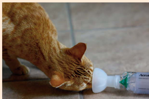
Figure 4: Placing a treat near the inhaler will encourage investigation of the device